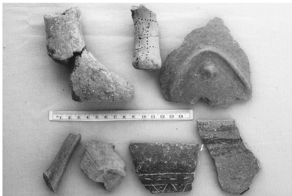
Fig. 4. EBA and MBA pottery from Güllüavlu, Sinop region.