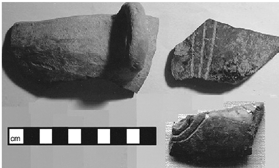
Fig. 3. EBA pottery from Kocagöz Höyük, Sinop region.